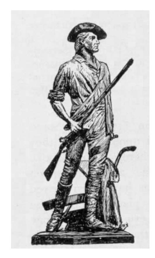
The Sons of the American Revolution may be an unknown organization to you.

The Leading Heritage Organization for Men